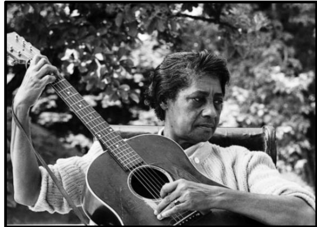
Elizabeth (Libba) Cotten